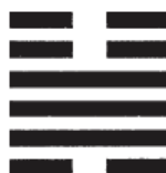
Fig. 3 Graphic representation of hexagram No. 32 Hen [3].

theme of constancy was outlined. If the interaction was not subject to some certain and constant inviolable and unchanging laws, then it could not acquire its sign of unity. Therefore, a situation called stability is considered as a private moment of the previous process. Transferred to the symbolism of the family, this is the constancy of marriage. However, sustainability aims to prepare for further human activity. Therefore, here it is necessary to keep in mind not only stability itself, but also the future exit to the outside. This is symbolized by the trigrams that make up this hexagram. The lower trigram is characterized by penetration, even mutual penetration [3].