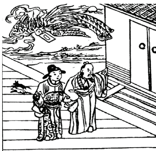
Fig. 2 Image for hexagram No. 32 of I Ching Hen [8].